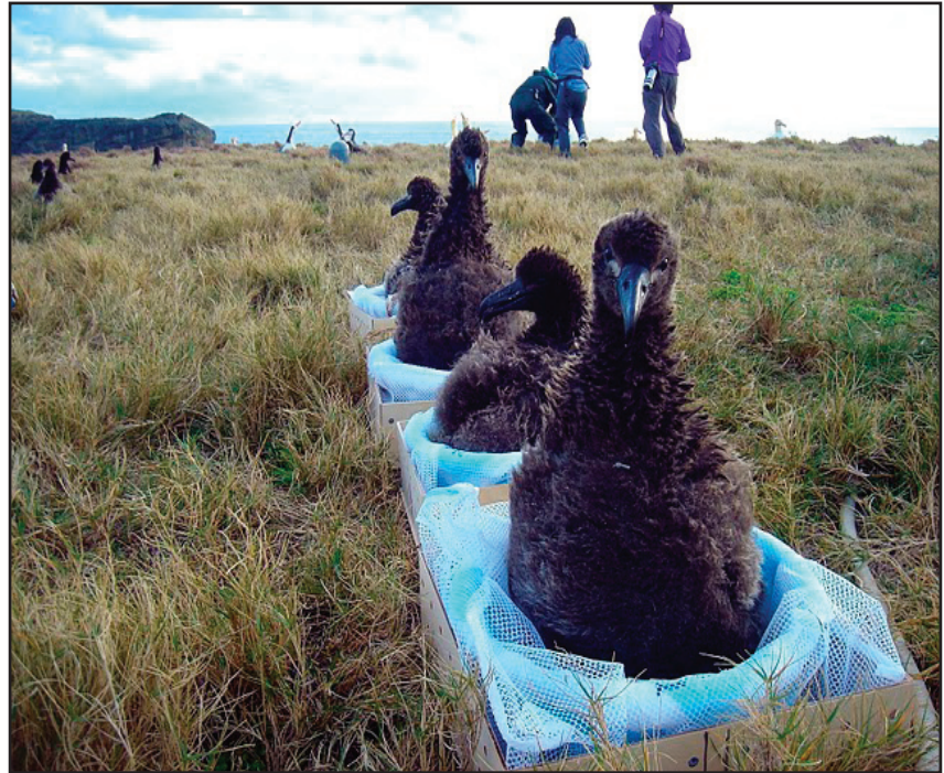
Short-tailed albatross chicks sitting in transport boxes and awaiting their helicopter ride to the translocation receiving site at Mukojima.

Today, STAL are found on just two of the estimated fourteen historical nesting islands: Torishima, and the Senkaku Islands. Torishima, which hosts 85% of the STAL breeding population, is an active volcano that last erupted in 2002. In addition to the threat of future volcanic eruptions, the Torishima STAL colony is